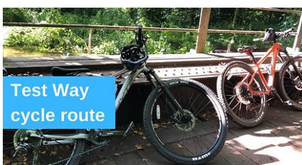
Test Way cycle route