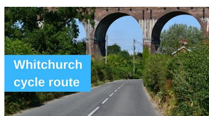
Whitchurch cycle route